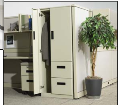
Full Storage Cabinets