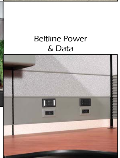
Beltline Power & Data